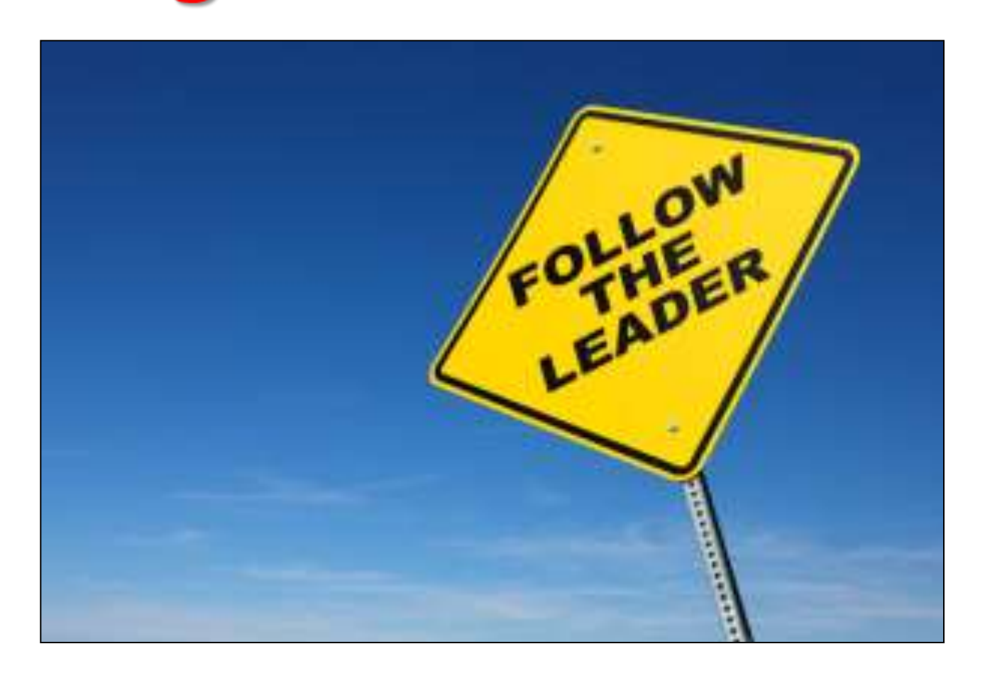
You too? PS. Don't forget Zechariah 4:6